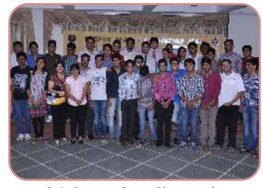
Quiz Contest- Group Photograph