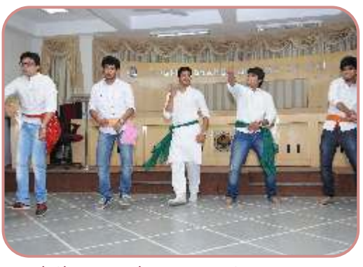
Ek Shaam Desh Ke Naam- Group Dance