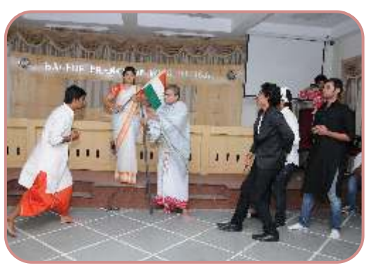
Ek Shaam Desh Ke Naam