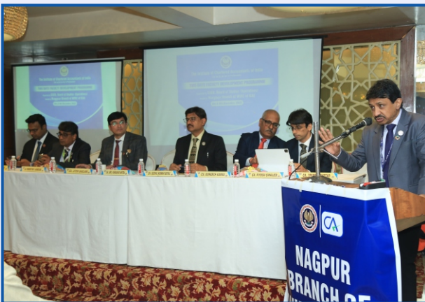
Faculty Development Program