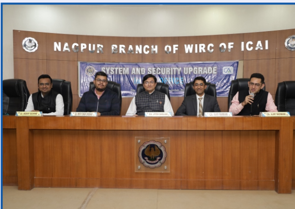
System and Security Upgrade in CA's office