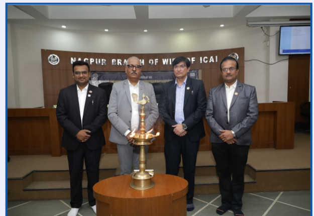
Seminar on Audit Quality Maturity Model