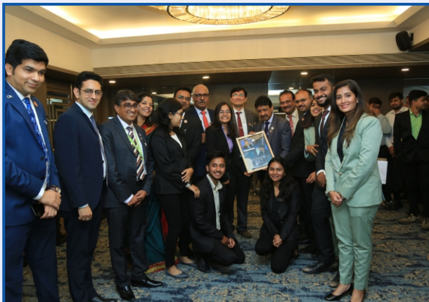
WICASA office Bearers with Hon. President, ICAI