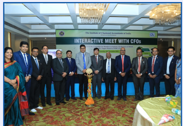
Interactive Meet with CFO