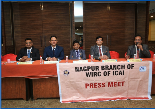
Press Meet with Hon. President, ICAI