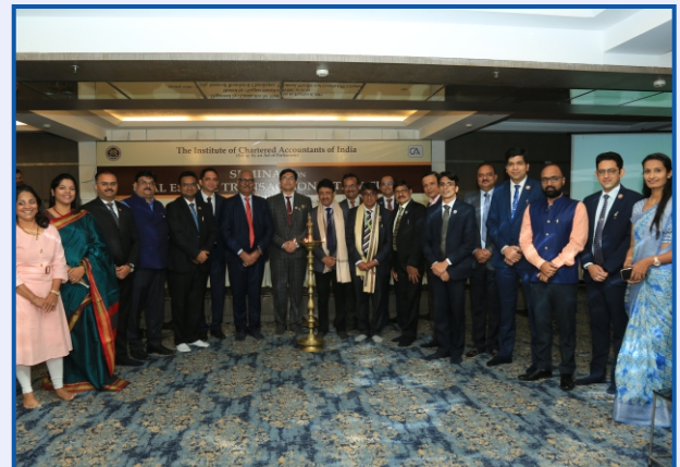
Seminar on Real Estate Transaction & Taxation