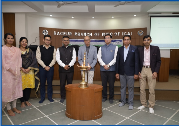
Seminar on Emerging Areas of Practice