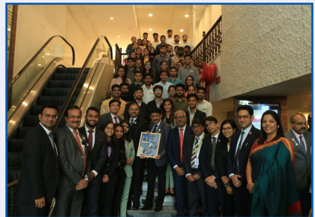
Interactive Meet of CA Students with Hon. President, ICAI