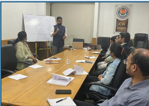
Study Circle Meet on Basics of Information and Registration of Companies and LLPs-18th Jan-23