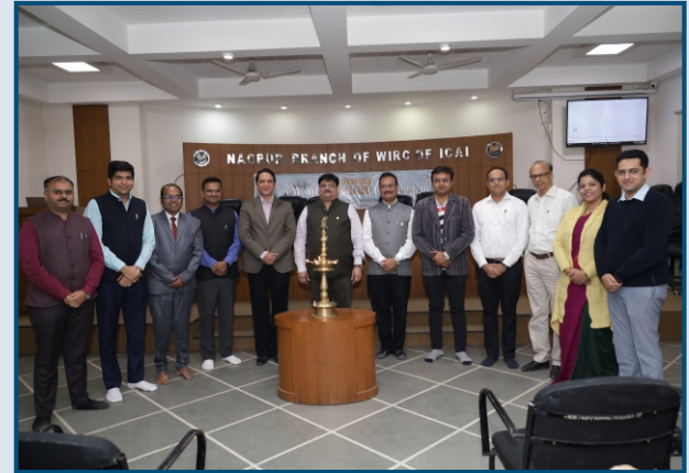
ICAI Startup SAMVAD-9th Jan-23