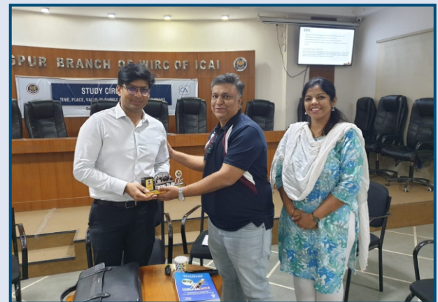
Study Circle Meet- Time, Place, Value of Supply and Its Tax Implications