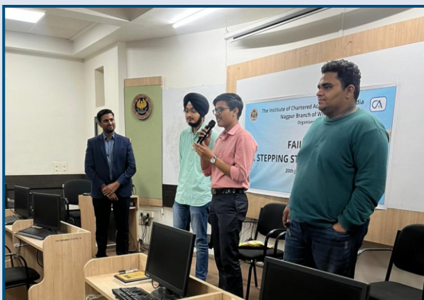
WICASA - Failure A Stepping Stone to Success